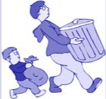
Separate yard trash and household garbage.

A: State laws prohibit disposal of yard trash in a lined landfill. Separate to ensure waste is collected and complies with state laws regarding solid waste disposal.