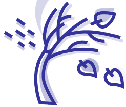
Protect your property by trimming tree branches BEFORE a storm.