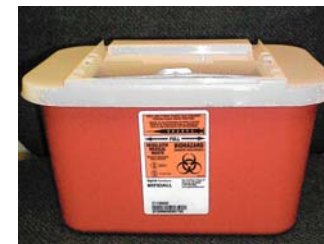
An approved sharps container.