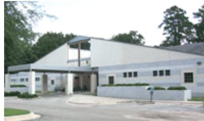
Robert and Stevens Medical Center on Old Bainbridge Road.

Washington, D.C., (December 16, 2004) - The Environmental Protection Agency (EPA) issued new recommendations on disposal of used syringes generated at-home, a move that may ultimately change the way the Americans dispose of used syringes. The new recommendations no longer suggest residents throw their used needles in the garbage, but encourage disposal of their used needles through other means; such as, community drop-off programs, household hazardous waste (HHW) facilities, sharps mailback programs or at-home needle destruction devices.