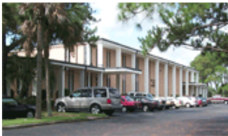
Leon County Health Department on Municipal Way.

ALL needles should be treated as if they carry a disease. That means if someone gets stuck with a needle, they have to get expensive medical tests and worry about whether they have caught a harmful or deadly disease. Be sure to get rid of your used needles the safe way to avoid exposing other people to harm.